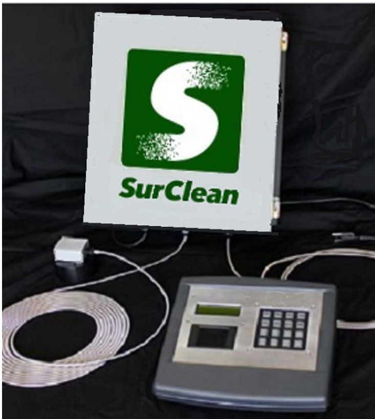
LPC Sensor, Controls and Pendant